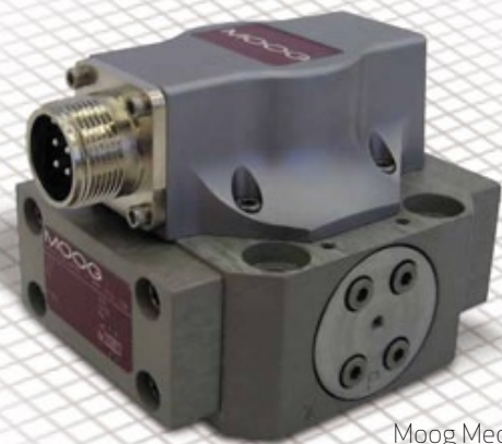
Moog Mechanical Feedback Servo Valve